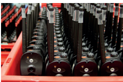
Intercom & Radio Solutions