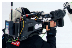
RF Camera Solutions