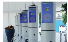
Access Control & Accreditation Solutions